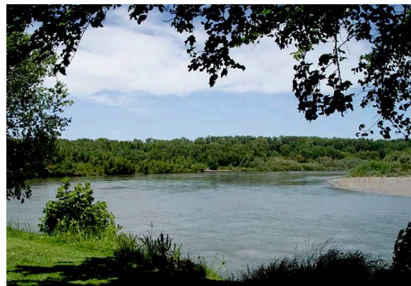
Figure 1: Sacramento River near Colusa, California

It is recommended that the SOIs remain coterminous with the district boundaries