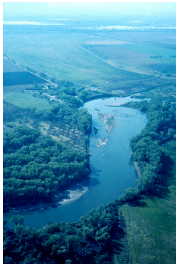
Figure 7. Colusa Bypass

The County Auditor reported that for fiscal year 2005-2006 the District maintained a record of the payment of outstanding bills. The District issued receipts for all revenues collected. The accounting controls of the District funds were maintained by the County Auditor. There were no recommendations. 42