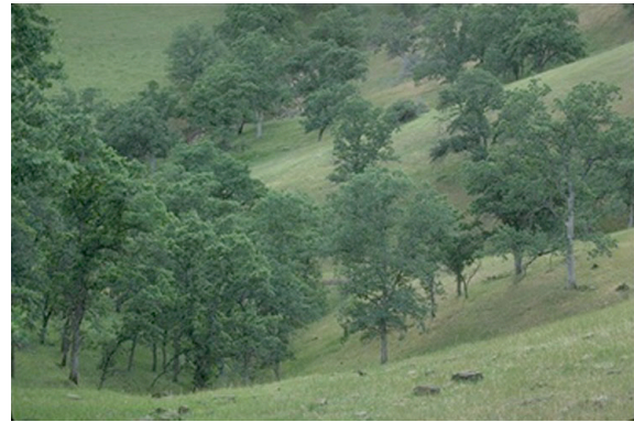
Figure 10. Woodland forest

The expenditures in 2004-2005 were $9,131. The approved budget for 2006-2007 was $26,985. 61 On June 30, 2006, the District had $249,739 on deposit with the County Treasurer.