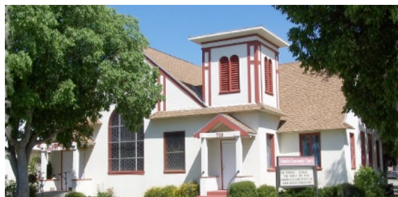
Figure 3. Arbuckle Community Church

The County Auditor reported that for fiscal year 2005-2006 the District maintained a record of the payment of outstanding bills. The District issued receipts for all revenues collected. The accounting controls of the District funds were maintained by the County Auditor. There were no recommendations. 13