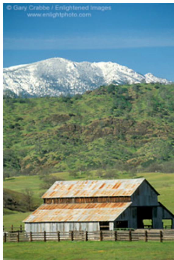
Figure 2. Old barn

The Antelope-Black Mountain Cemetery District is inactive. The contact for this District is the Colusa County Auditor's Office. 2 The Antelope-Black Mountain Cemetery District has one cemetery (Assessor's Parcel No. 11-150-016) 3 , one acre in size located one half mile northwest of Sites. The land for the Cemetery was donated by John Sites but is still owned by the Sites Family.