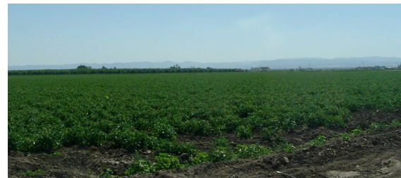
Figure 4. Land near College City California

The County Auditor reported that for fiscal year 2005-2006 the District maintained a record of the payment of outstanding bills. The District issued receipts for all revenues collected. The accounting controls of the District funds were maintained by the County Auditor. There were no recommendations. 23