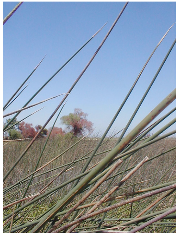
Figure 8. Sacramento Valley

The County Auditor reported that for fiscal year 2005-2006 the District maintained a record of the payment of outstanding bills. The District issued receipts for all revenues collected. The accounting controls of the District funds were maintained by the County Auditor. There were no recommendations. 48