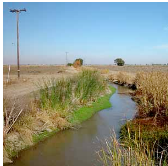
Figure 11. Williams area

The County Auditor reported that for fiscal year 2005-2006 the District maintained a record of the payment of outstanding bills. The District issued receipts for all revenues collected. The accounting controls of the District funds were maintained by the County Auditor. There were no recommendations. 70