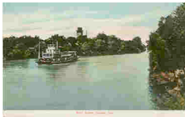
Figure 5. Old Colusa river scene

The County Auditor reported that for fiscal year 2005-2006 the District maintained a record of the payment of outstanding bills. The District issued receipts for all revenues collected. The accounting controls of the District funds were maintained by the County Auditor. There were no recommendations. 31