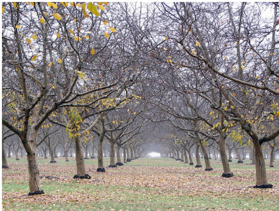
Figure 9. Walnut grove

The County Auditor reported that for fiscal year 2005-2006 the District maintained a record of the payment of outstanding bills. The District issued receipts for all revenues collected. The accounting controls of the District funds were maintained by the County Auditor. There were no recommendations. 54